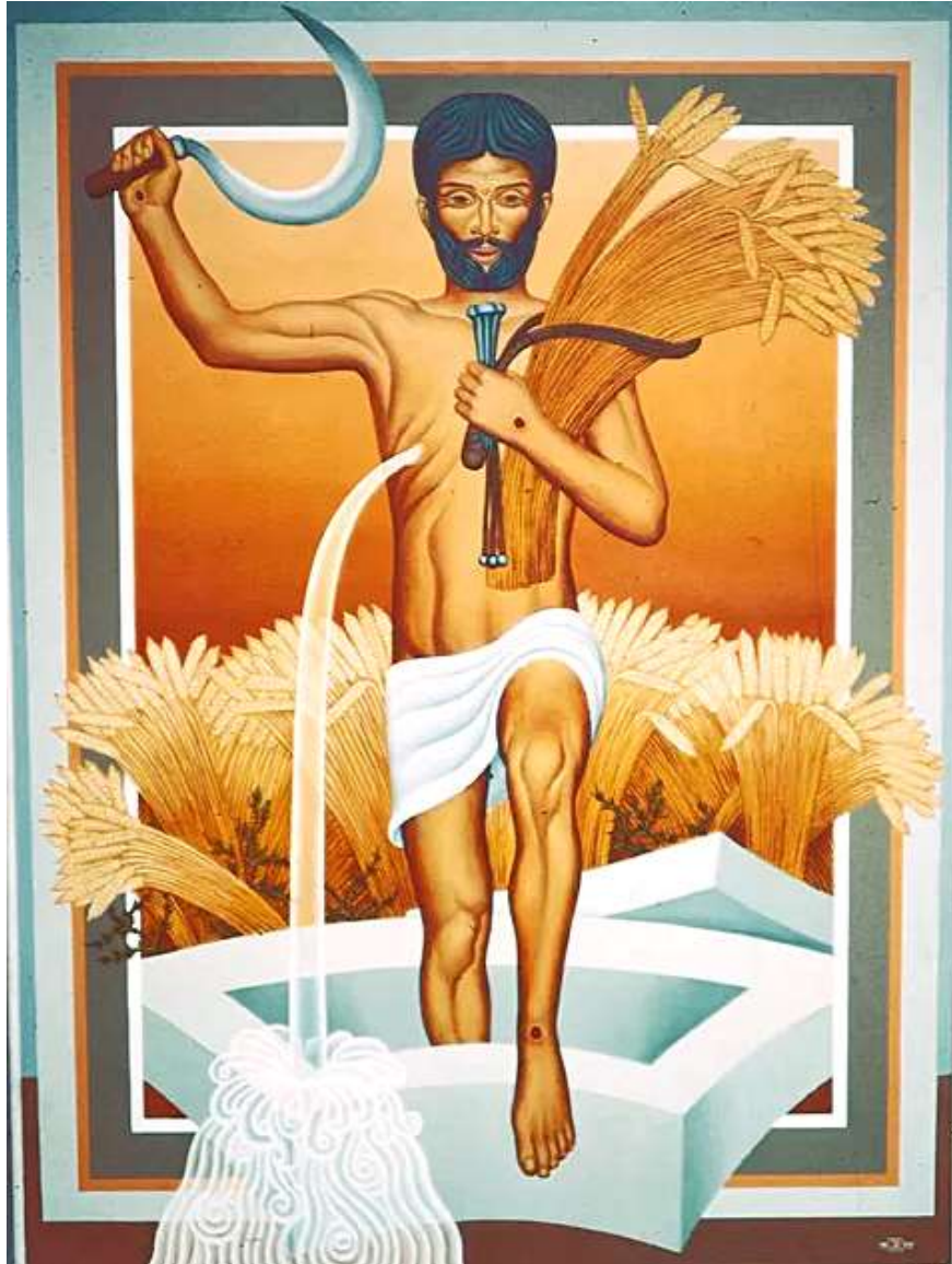
Image: Koenig, Peter, 1975 "Harvest Resurrection" (United Kingdom)