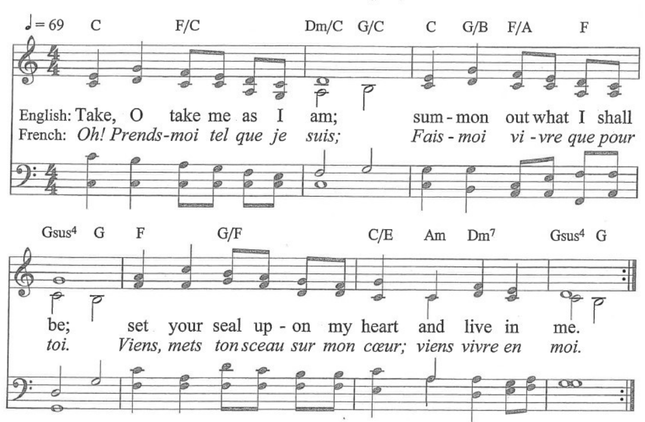
This song of discernment intentionally ends on an open harmony. Try leaving it unresolved.